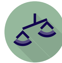
Identify Variations against the message standard

CIVET is a real-time message decode, monitoring and recording facility for Link 11 and Link 16 platforms. Developed to be utilised with real terminals/radios or in a simulated environment. CIVET provides the user with the capability to detect, identify and investigate message anomalies in real-time for compliance with the selected Tactical Data Link (TDL) Standard.